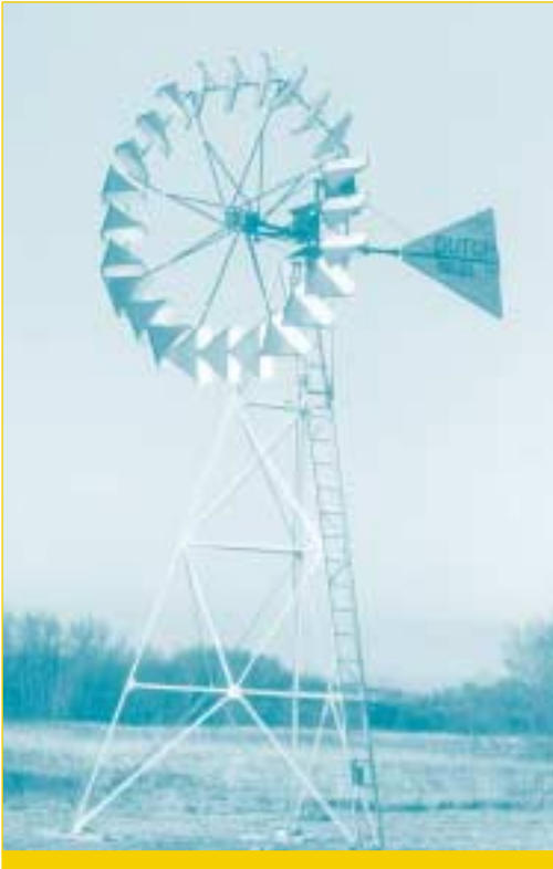
▲ Mechanical water pumping system.